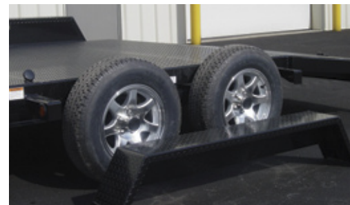
Removable Fenders & Aluminum Wheels