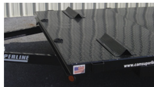
Adjustable Wheel Chocks