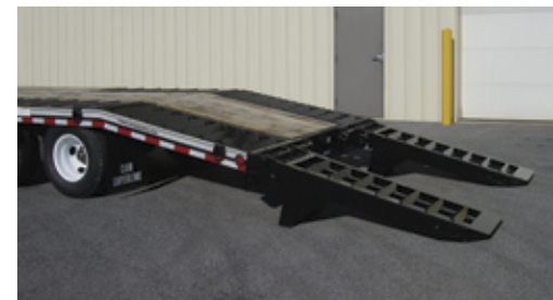
Self Clean Beavertail & Ramps