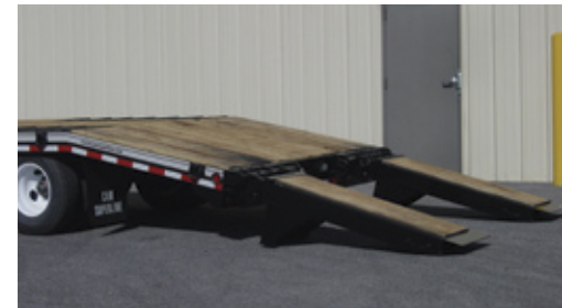
Wood Filled Ramps